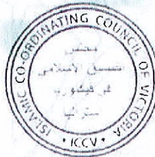
ICCV Organisation Seal