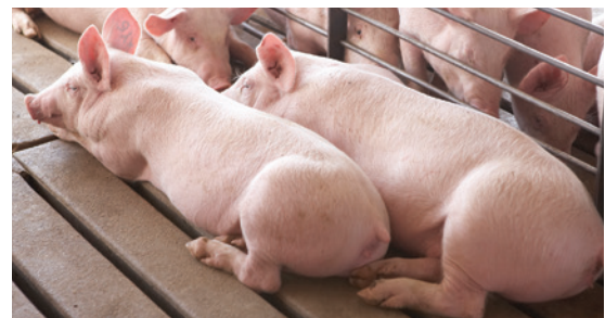
Company-owned farms will be transitioned to group sow housing by 2018.

Hormel Foods is committed to the highest standards for animal care and handling. Through proper training, on-site assessments, and other means, we ensure our employees are practicing safe, ethical animal care.